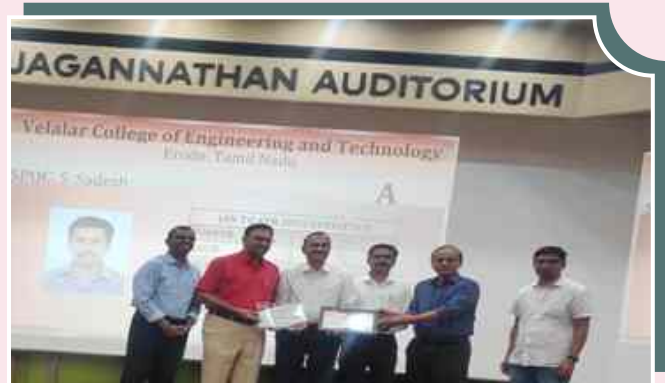
VCET one among in Top 100 Swayam NPTEL Local Chapters based on participation and performance of candidates in Jan-Apr 2023 exams across India.