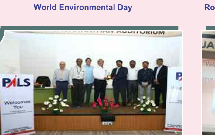
VCET receiving Appreciation plaque for Excellence participation in PALS 2022-23